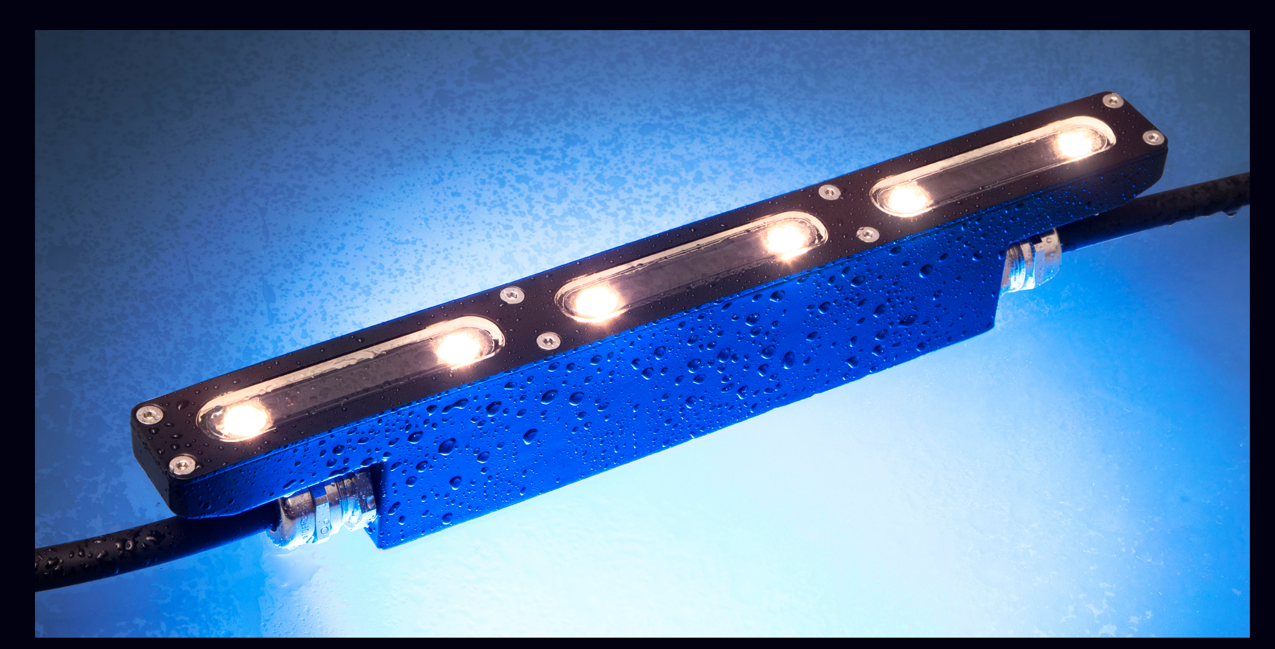
Euclid 30 IP68 System Underwater IP68 LED linear lighting system 6 x high power LEDs with lenses per 0.3mtr module