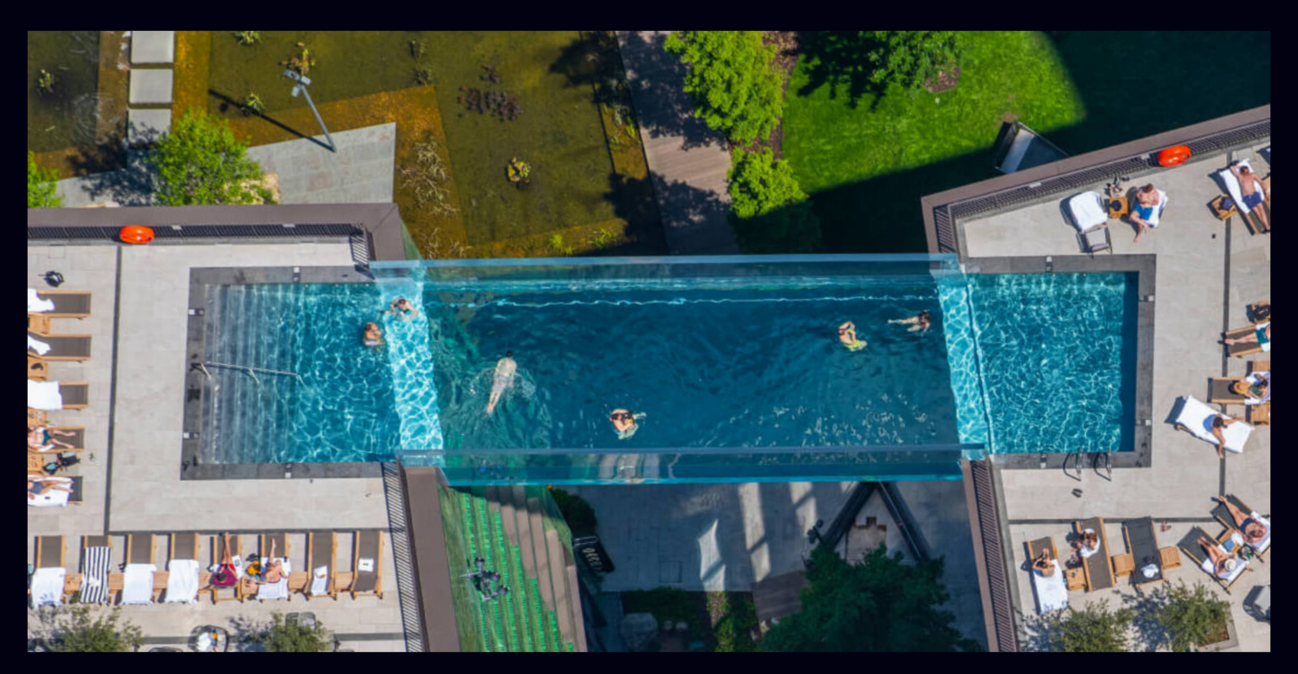
Sky Pool, Embassy Gardens, London Lighting design by GIA Equation Project photos by Ballymore

GIA Equation specified Radiant's Euclid 30 IP68 System to illuminate the 25-metre-long crystal clear Sky Pool which stretches between the rooftops of the Legacy Buildings at Embassy Gardens. An impressive feat of engineering, the Sky Pool is the only one of its kind.